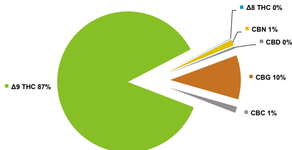
Ratio Of Cannabinoids (total 100%)