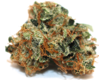
Terpenoids Profile (out of %100 of detected terpenoids)