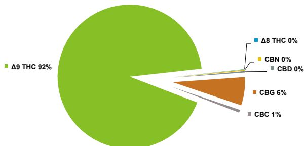
Ratio Of Cannabinoids (total 100%)