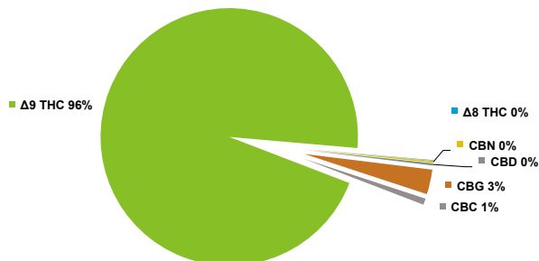
Ratio Of Cannabinoids (total 100%)