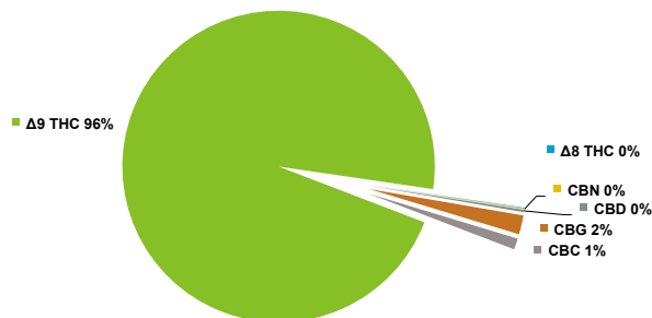
Ratio Of Cannabinoids (total 100%)