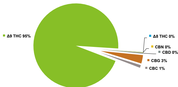
Ratio Of Cannabinoids (total 100%)