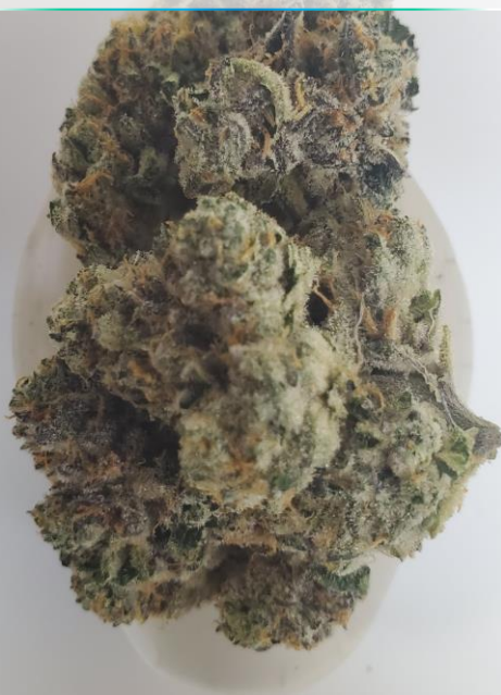
Black Betty 5.4.20

No Pesticides Were Detected above Oregon's action limit as stated in OAR 333-007-0400